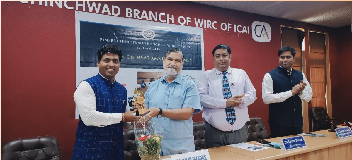
Physical Seminar on MVAT Amnesty Scheme on 9.4.2022.